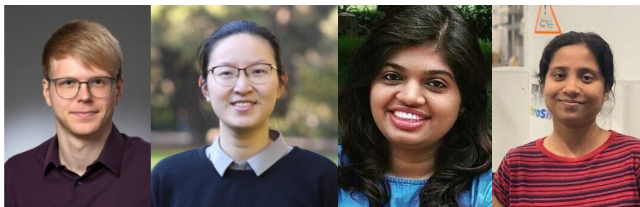
Organizers, GNMR (Left to Right)